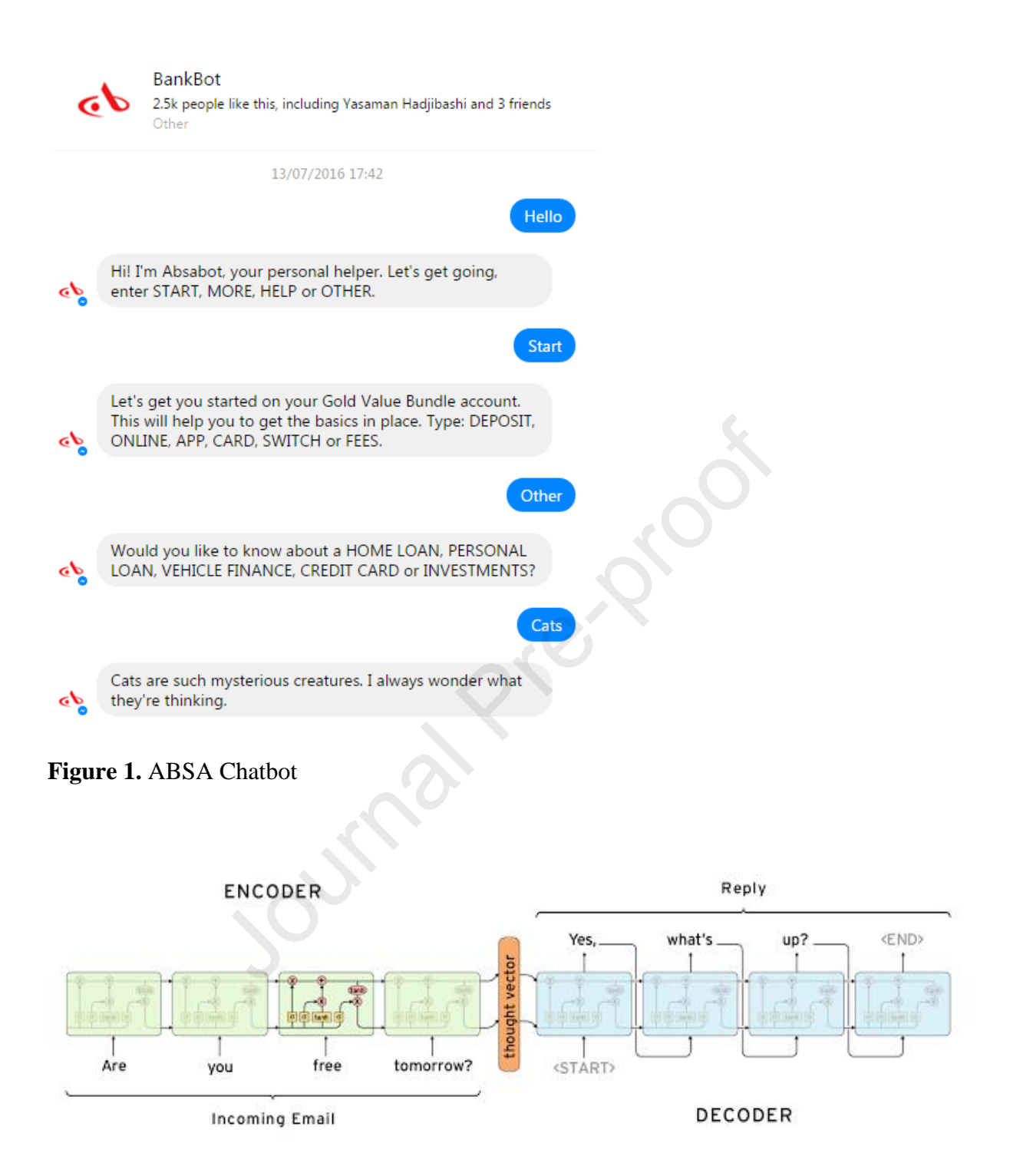
Figure 2. Decoding an email to create a response (WildML, 2016)